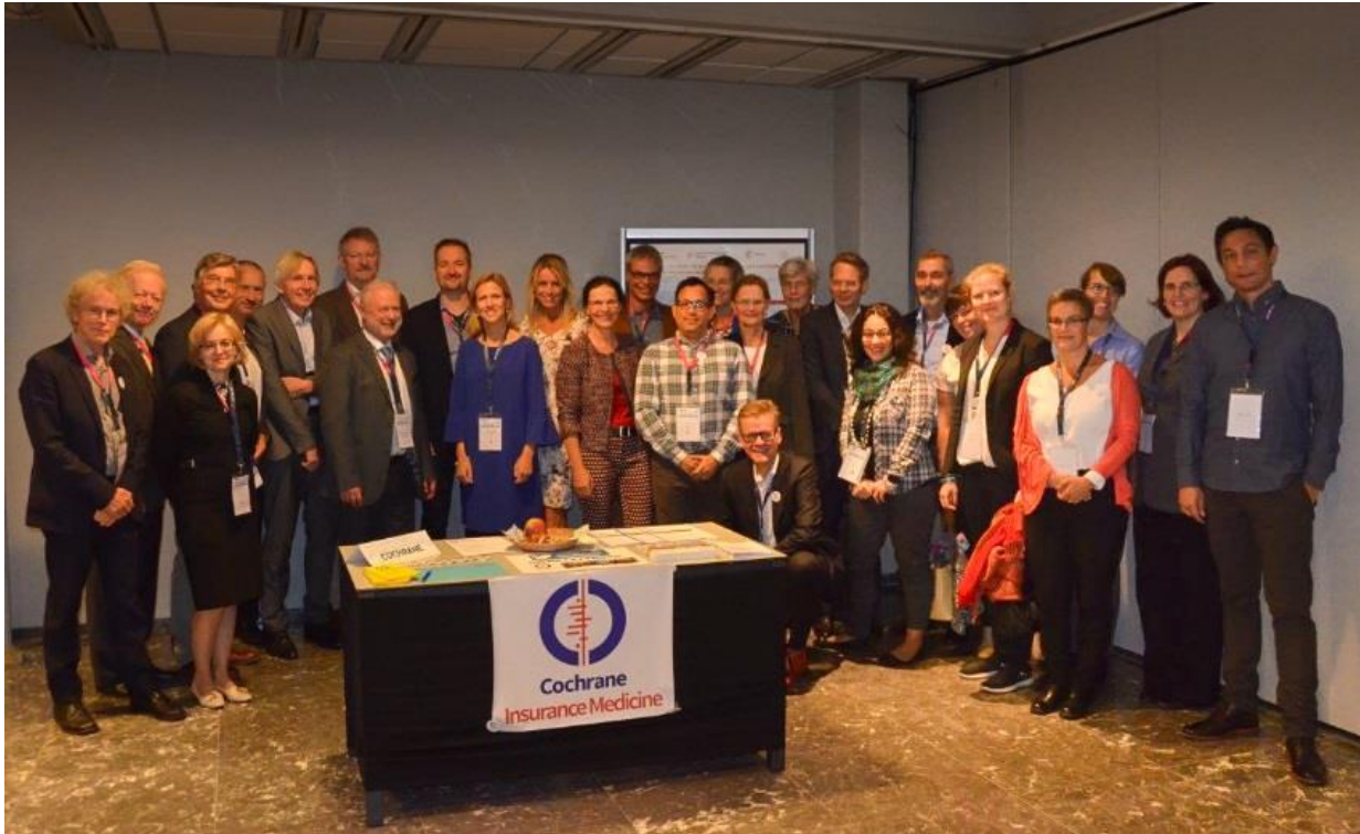
Cochrane Insurance Medicine and its friends at the EUMASS Congress 2018, Maastricht, the Netherlands.