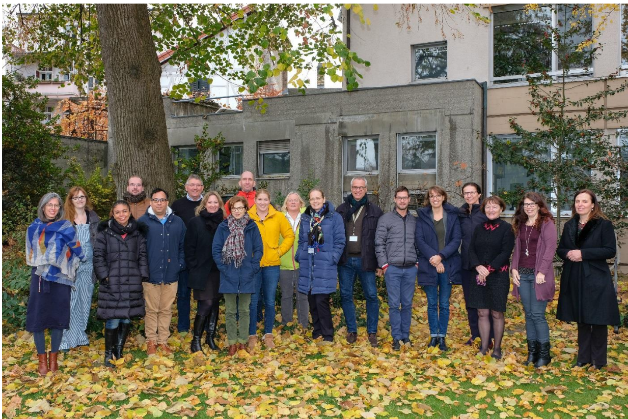
Master in Insurance Medicine, University of Basel, Swiss TPH. Participants of the module Evidence-based Insurance Medicine.