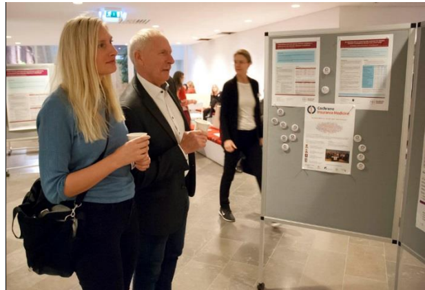
15 year Insurance Medicine, Karolinska Institutet, Sweden